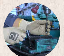
INSTALLING METAL STRUCTURES