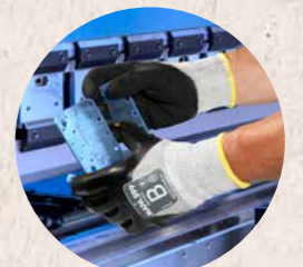
HANDLING SHEET METAL